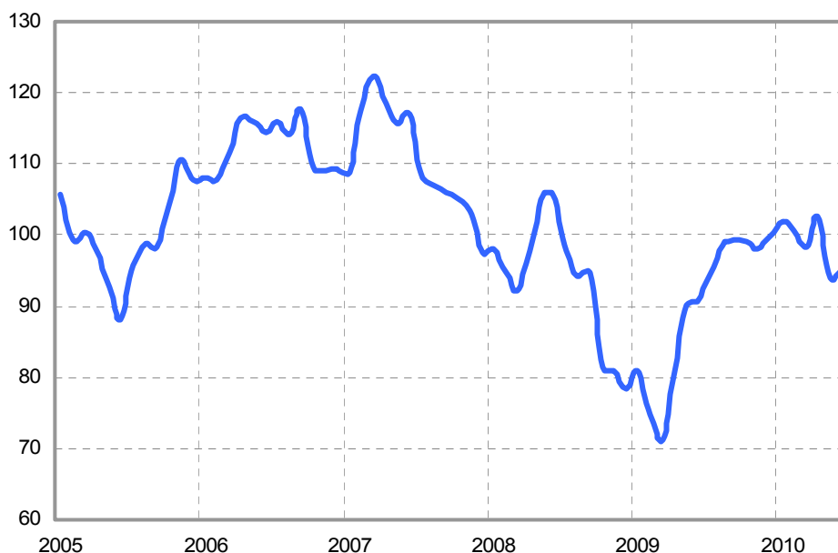
CONFIDENCE CLIMATE (index 2005=100, seasonally adjusted)

• With regard to the variables excluded from the calculation of the confidence index, evaluation of current employment moderately recovered, while assessments on business activity remained stable, at a slightly negative value, and the balance for employment prospects worsened